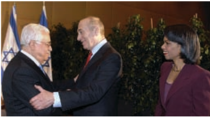
President of Palestinian authority Mahmoud Abbas, Israel's Prime Minister Ehud Olmert and US Secretary of State Condoleezza Rice.

There was general agreement at the conference that the main obstacles to a peace settlement are more symbolic than practical. The issues of the peace process may be divided into two categories: those where an agreement is within reach in the short term; and those which remain loaded with historical and religious symbolism and which are far more contentious.