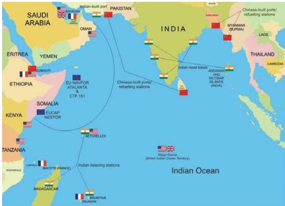
Big Power Presence in the Indian Ocean

India has not stood idly by. In 2012, New Delhi expanded its naval presence on the Andaman and Nicobar Islands in the Bay of Bengal. The islands constitute a strategic outpost for controlling the Western side of the Malacca Straits bottleneck, and facilitating its engagement with South-East Asian navies, including the deployment in the South China Sea, where it is becoming increasingly involved. The repeated references to the 'Indo-Pacific' in India's new Maritime Security Strategy (published in October 2015) reflects a