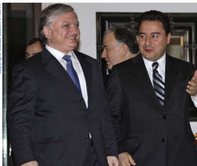
Armenian Foreign Minister Edward Nalbandian, left, is welcomed by his Turkish counterpart Ali Babacan upon his arrival for their meeting in Istanbul, Turkey, Monday, 24 November 2008.

Turkey has solid and well-grounded foreign policy motives for the normalisation of its relations with Armenia. Turkey's new policy to minimise problems with its neighbouring countries has been successful, with the exception of Armenia. Turkey is engaged in mediation and facilitation activities in the Middle East and follows an active policy in the surrounding regions. The Russia-Georgia conflict, the stalemate in Azerbaijan-Armenian relations, the emergence of a Cold-War style West-Russia rivalry, and the formation of regional groupings around this binary opposition are immediate sources of concern. These can lead to further armed conflicts and constitute threats to the stability and security of the region. Furthermore, the